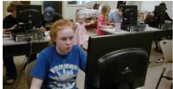
Technology helps you Start Here—Go Anywhere!

newsletters and other communications from her son's military commanding officer on a regular basis. She was even able to see a digital photo of her son in a Humvee as his company